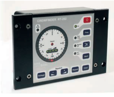
Aluminum housing with panel mounting brackets