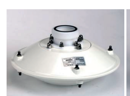
Screw flange (standard)