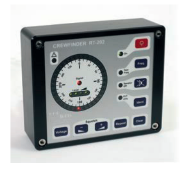
POM housing (standard)